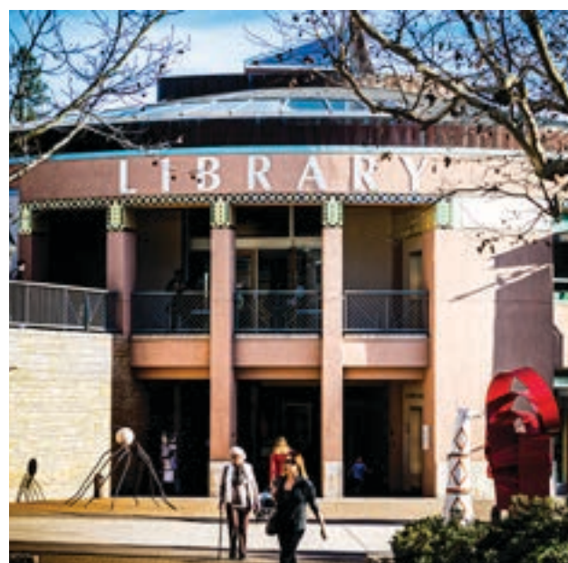
The Orinda Library