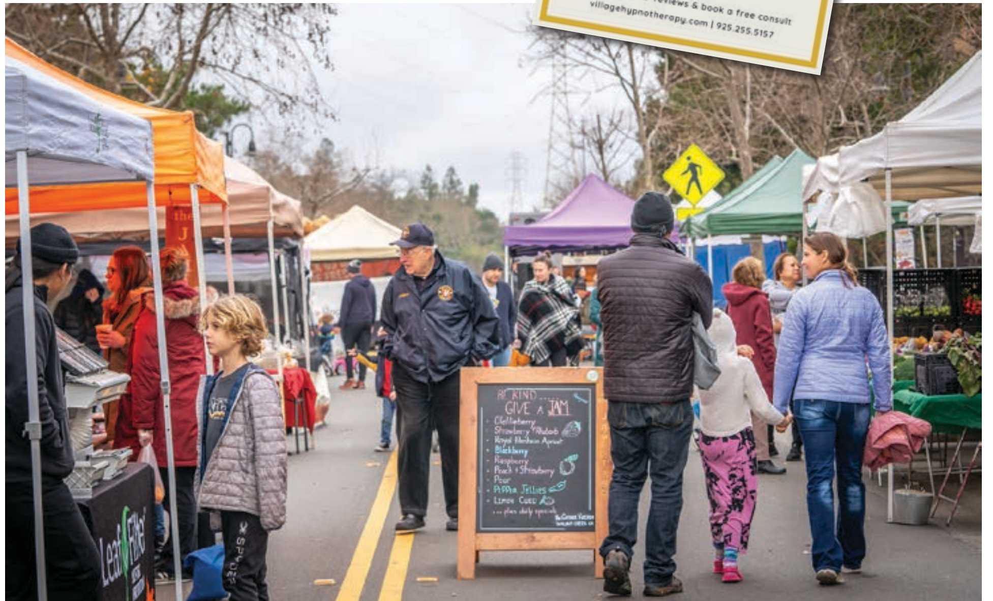
A chilly day at the Orinda Farmers' Market in front of the Orinda Community Park in Orinda Village.